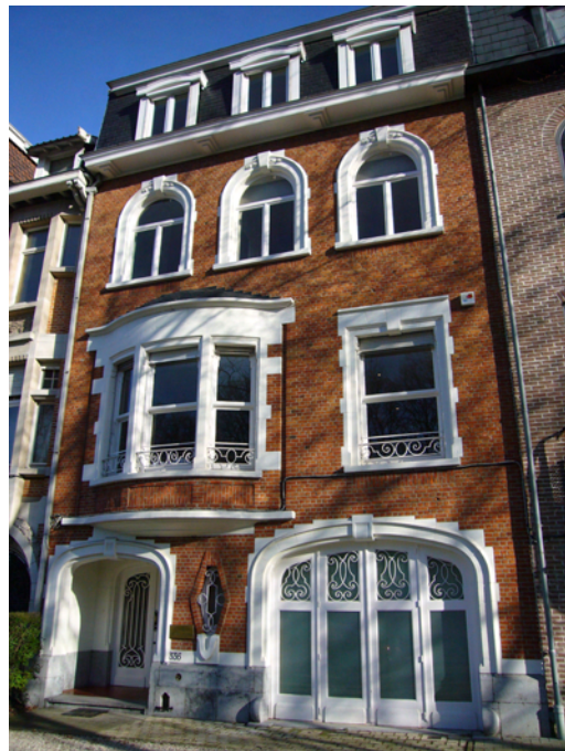
Our offices in Brussels

Process and Project Improvement for better IT Governance www.adjugo.com